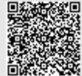
Pharma Industrial Engineering Zebulon, NC