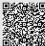
Cybersecurity Phila, PA

Visit gsk.com/careers and search #FLPUS2024 for all other roles