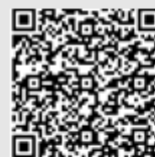
Digital & Tech Phila, PA