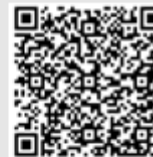
Research Data Science Phila, PA